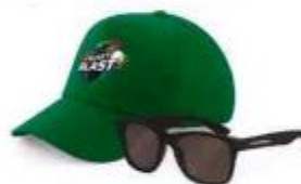
Master Blasters KIT

The club will also be fielding multiple junior cricket teams across all age groups