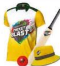
Junior Blasters KIT