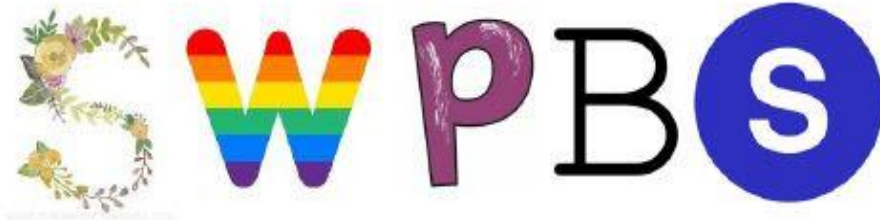
School Wide Positive Behaviour Support

We've had a fantastic start to Term 2 with SWPBS up and running straight away! Students have jumped back into following our school values of respect, responsibility and safety, and it's been great to see so many positive behaviours across classrooms and the yard in just the first two weeks.